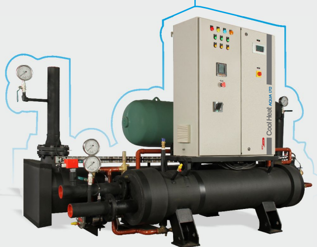
Available from 110 KW to 1 MW Capacity