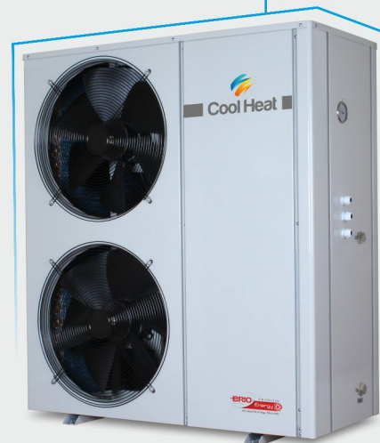
Available from 7 KW to 120 KW Capacity

Now it's possible to balance nature without burdening your balance